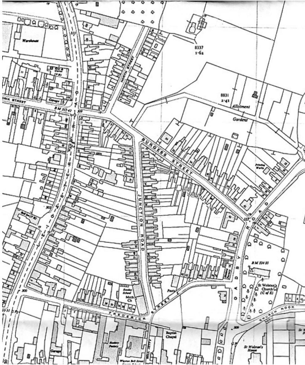
1955 map showing Junction Road. Nos. 43 & 45 are the semi-detached pair, which are the 8 th & 9 th houses past the Methodist Church buildings. No: 43 is to the north of 45.